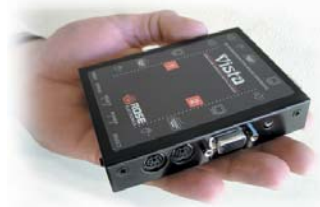
Vista-mini has Hi resolution video and stereo audio

Call us for more information on this excellent family of full-featured, easy-to-use, and economical KVM switches.