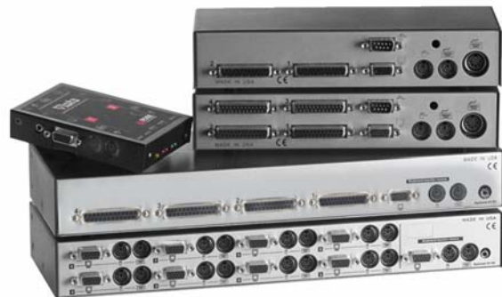
Rear view of Vista models KVL-8PCA, KVL4UA, KVT-2PC, KVM-4UPH, KVM-2UPH

■ Phone: 281-933-7673 ■ E-mail: sales@rose.com ■