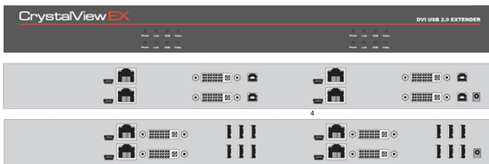
CrystalView EX5 Rack – showing TX/RX Quad-Unit Extenders

CrystalView EX5 Rack For applications that require multiple extenders with high density racking, the CrystalView EX5-Rack is a compact alternative. Two, three or four extenders can be combined in a single 1U, 19" rack chassis. The remote end can be either a rack chassis with a matching number of receiver units, or multiple single extender units.