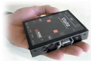
Vista-mini has Hi resolution video and stereo audio

Call us for more information on this excellent family of full-featured, easy-to-use, and economical KVM switches.